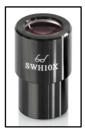
High Eye Point eyepiece (identified by the glasses symbol)