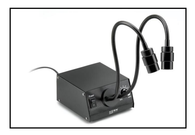
Typical goose neck lighting unit

The lighting units which are suitable for devices of the OZL-46 series, are goose neck lighting units (see figure). These are available as LED as well as halogen versions and also have an on/off switch or different controller.